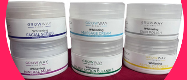
6 Premium Product